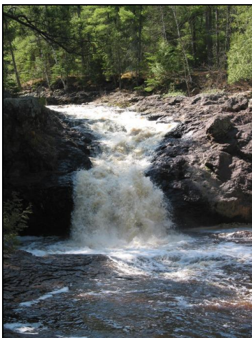
The upper falls at Amnicon Falls State Park.

For beautiful waterfalls, there are two choices. One is Minnesota's Gooseberry Falls State Park located about 35 minutes north of Duluth on Highway 61. I-35 north becomes MN Hwy 61. Follow this past Two Harbors and then follow signs to the park. A Minnesota State Park sticker is required.