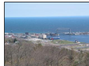
A portion of the view from Enger Tower

From Hwy 53 north, follow signs to Enger Golf Course. Follow Skyline Parkway past the Golf Course to Hank Jensen Dr. where you go left 1/4 th mile to Enger Tower.